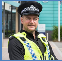
A Police Officer