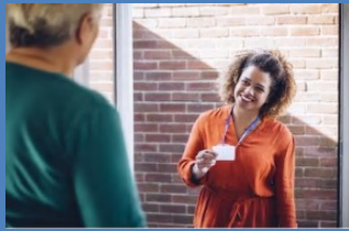
A Care Worker or Social Worker

If any of your friends are treating you badly, tell someone you trust